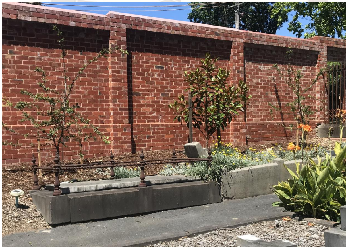
Three trees near the Parkhill Road gate