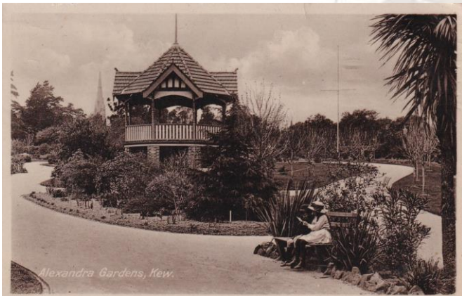
Alexandra Gardens, Kew

Still, for over 150 years, sending postcards was almost an obligatory part of a holiday. "Did you remember to send your postcards" was the question asked at the end of a holiday? Did I forget to send a postcard to my friend, auntie or next-door neighbour?