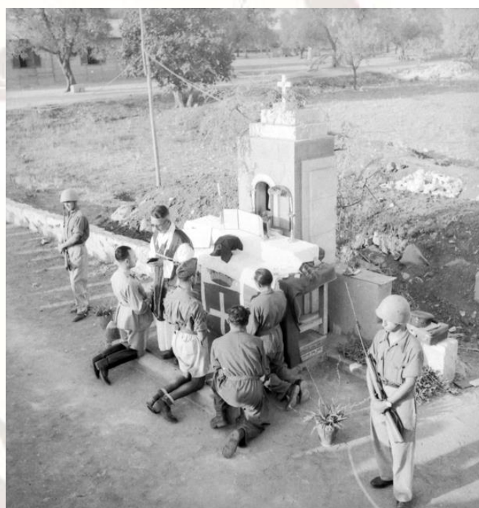
Grottaglie, Italy. 1943.

Still today, many men who were touched by these men's ministry nearly half a century ago, have spoken of their profound appreciation of that Ministry and their affection for those who offered it.