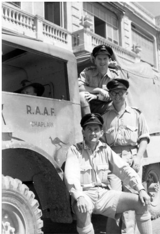
Naples, Italy. c. May 1944.

Three Australian padres meet in Naples after visiting RAAF personnel throughout the Italian theatre of war.